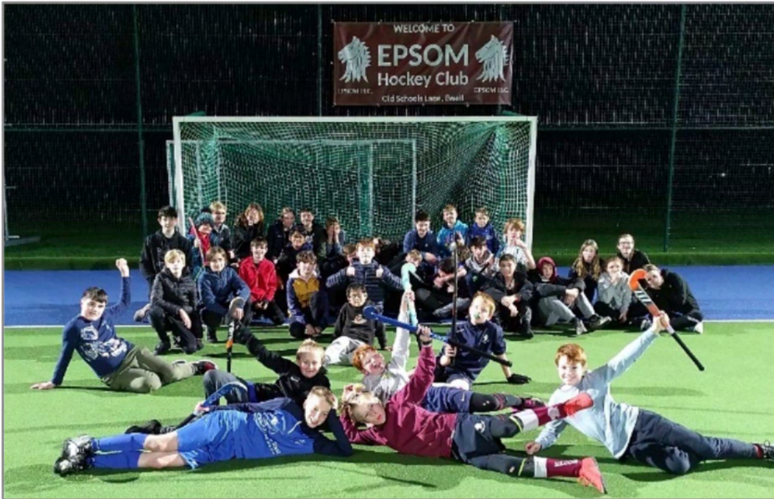
Epsom Hockey Club hosted an evening for the Scouts