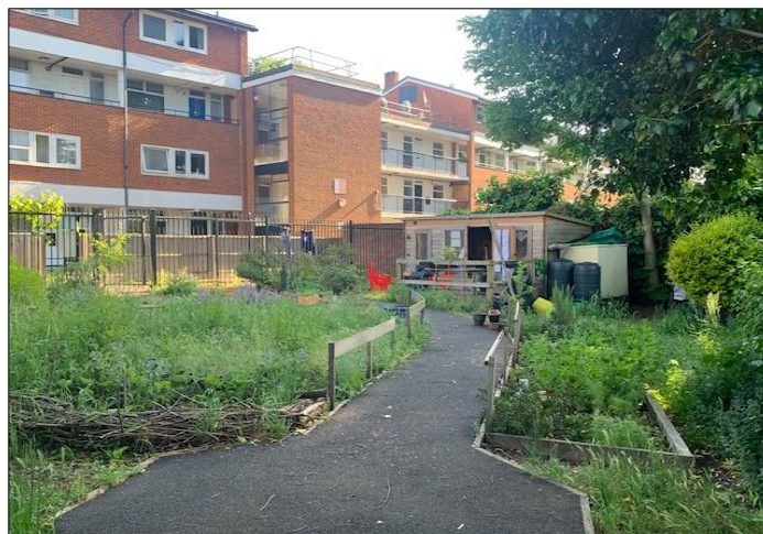
Nature Gardens Highbury Quadrant estate

"Every little bit of help you can get at the moment with what's going on in this country is a bit of help. Thank you so much. Your service has helped me to know where to get help with my original concerns even if it hasn't been resolved yet." Winter Wellness resident