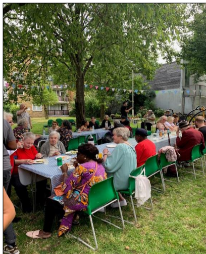
Community picnic July 2024