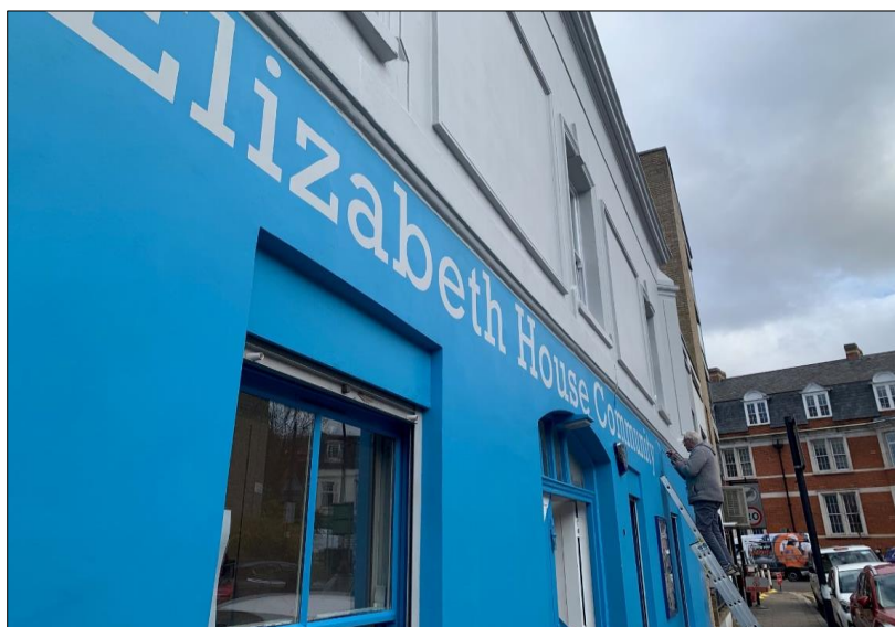
Elizabeth House, 2 Hurlock Street, London N5

The Trustees periodically undertake a review of the major risks to which the charity is exposed. Each year when considering the operating budget and strategic plan, the Trustees review the associated organisational and operational risks. The senior management team also review operational systems and procedures and service area risk assessments to manage risks that are in place. We review and update our risk assessments, business continuity and emergency contingency plans when needed.