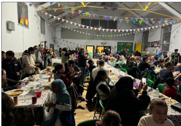
Annual community party October 2024