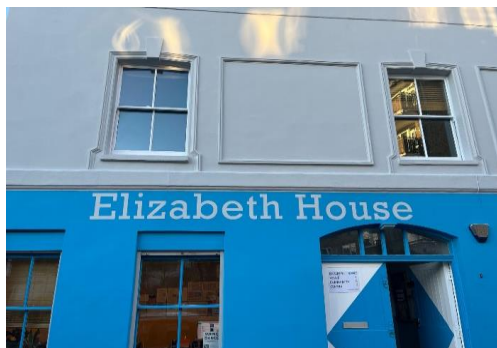
Building renovations in summer 2024

Elizabeth House continues to host other community groups running training sessions or classes, as well community groups looking for a space for regular meetings. There is a weekly church group on Sundays using our main hall and many residents from Islington and neighbouring boroughs hire our spaces for their private events. We also support local tenants and residents associations and other community groups by providing them space free of charge when needed.