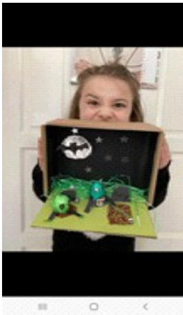
Easter egg competition winner

This has been a difficult year all round for everyone with all the things that have happened but as usual Oxhill Youth Club has confronted them head on and continue to deliver the excellent work for the community well done everyone and thank you for your support.