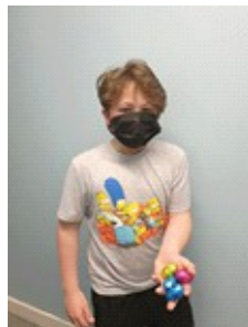
Easter egg hunt