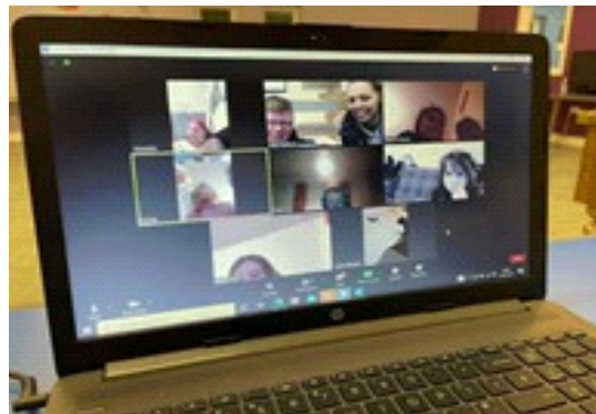
Zoom meetings with juniors