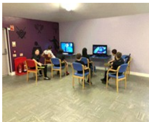
x box and play station games