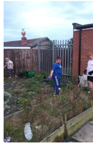
working on the John Muir award, bird feeders, bug hotel, and clean up