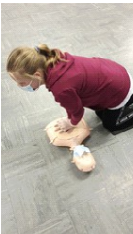
basic first aid