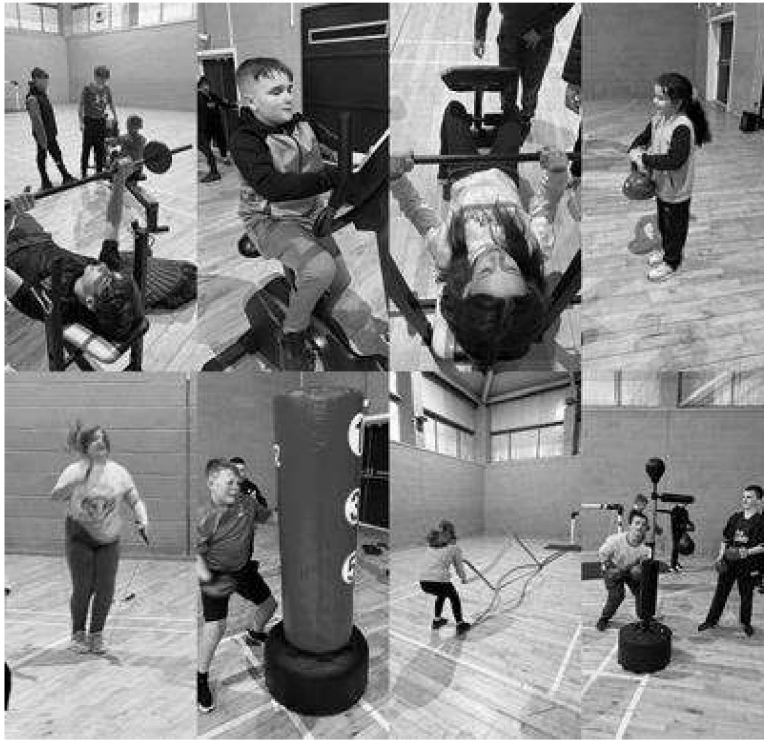
Pictures of the pool competition 2023, march visit to Durham Cathedral and members using our keep fit gym. September was our 60 th anniversary .