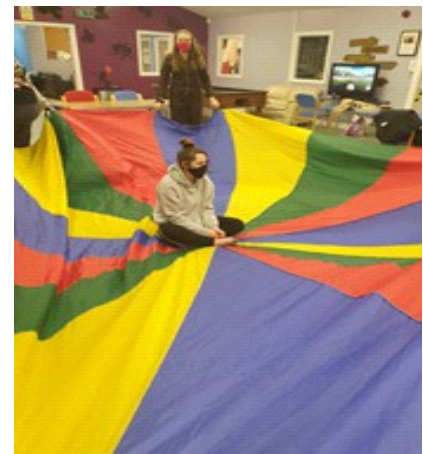
group parachute games