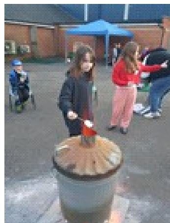
fire safety and marshmallow toasting