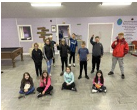
Durham youth council awards