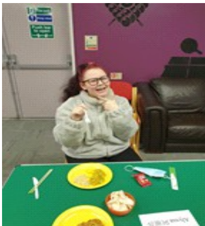
food tasting sessions