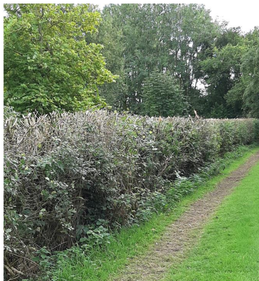
Hedges given a severe trim!

Fund raising and Community action:- Many of our members helped in any way they could, from working as Key Workers to fund raising and making Face masks.