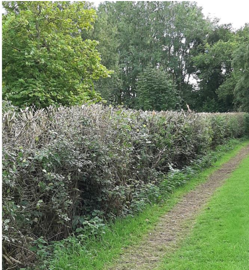
Hedges given a severe trim!

Fund raising and Community action:- Many of our members helped in any way they could, from working as Key Workers to fund raising and making Face masks.