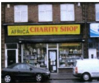
Liverpool Old Swan Shop