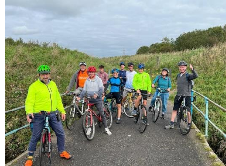
30 th Anniversary Cycle Ride from the Ainsdale shop to the Old Swan Shop