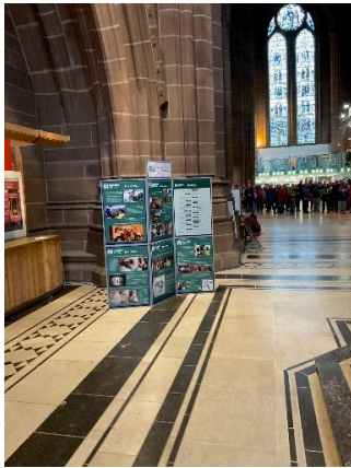
30 th Anniversary Exhibition in Liverpool Anglican Cathedral