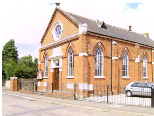
Deanshanger Methodist Church

Sadly, after 133 years, the roof began to leak quite badly so a full examination had to be undertaken. The initial estimate for the work was £11,500. With limited resources we commenced a fundraising exercise which included an application for a grant from the Trust.