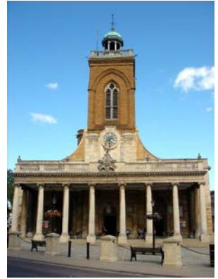
All Saints', Northampton

Stand in front and take a look at All Saints' in Northampton. All looks perfectly normal: in fact, just what you would expect in an ancient market town – a large church standing in its centre. But then take another look and what you see is not a substantial medieval edifice, a cruciform church rippling with crenellations. Instead beneath the high tower there is a classical building topped by a statue, not of a saint but of a monarch. If you penetrate inside, no high vaulted gothic structure confronts you but rather a sublime baroque interior centred on a dome. Isn't this all rather strange in a town surrounded by three medieval churches. Why? What happened?