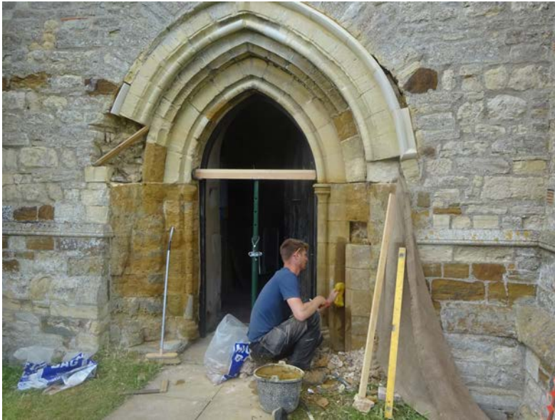
Tower doorway at St John the Baptist, Piddington, during repair works