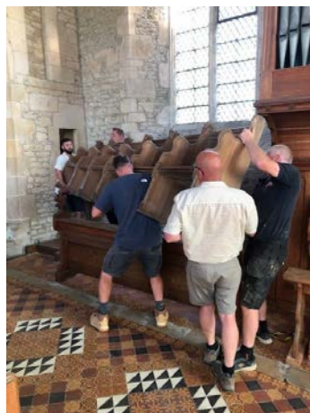
Many hands make light work at St Andrew's, Cotterstock

We are immensely grateful to Northamptonshire Historic Churches Trust for the grant of £5,000. St Andrew's is a notable landmark on the River Nene, and we as a PCC together with the villagers are committed to maintaining its upkeep.