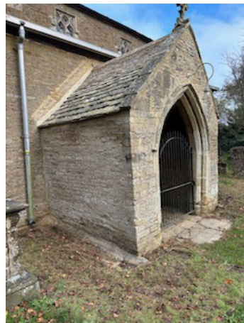
The repaired porch at All Saints', Croughton