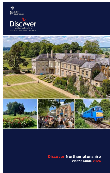
Discover Northamptonshire Visitor Guide