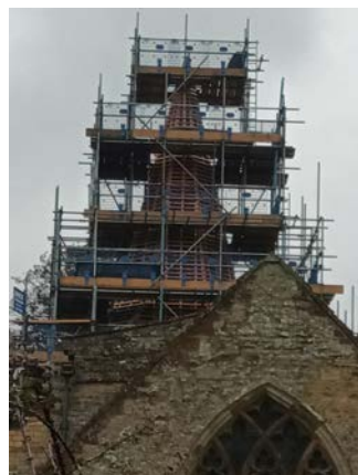
Syresham spire during repair work