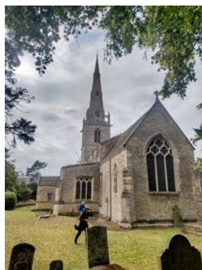
St Peter and St Paul, Easton Maudit