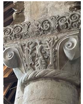
Romanesque column capital at St Peter's, Northampton