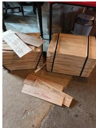
Oak shakes for the new tower spire at Syresham