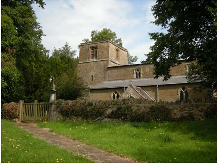
All Saints, Croughton

T his year I thought that we would have had more churches applying for grants with the aftermath of the pandemic, but alas not so. Although I had several phone calls, not so many ended by completing the application form; maybe the costs are higher than expected or timelines don't match.