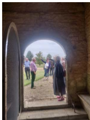
St Mary Magdalene, Castle Ashby