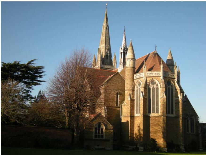
St Matthew's Northampton