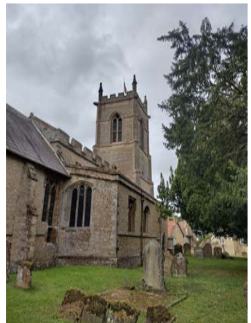
St Mary's, Grendon

It started in Grendon, a fine Medieval building with some double arcading and scallop capitals and some Compton heraldry including three catchments. The South Aisle houses an unusual Italian curtain from Castle Ashby House, probably from a sixteenth-century funeral service. The fifteenth-century Perpendicular tower includes bands of different types of ironstone.