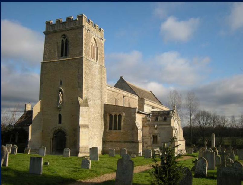
St Andrew's, Cotterstock

With thanks to all those who contributed to this Report