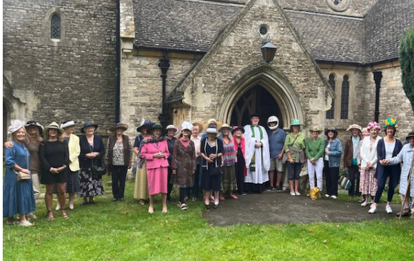
Hat sponsorship: a novel way of fundraising at St George's, Evenley

The next RIDE and STRIDE will be held on Saturday, 13th September, 2025