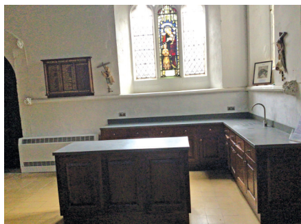
Discreetly designed servery at St Mary the Virgin, Higham Ferrers