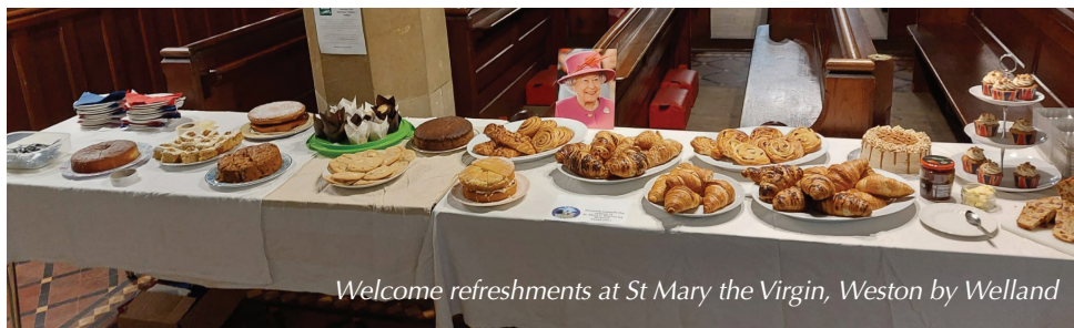
Welcome refreshments at St Mary the Virgin, Weston by Welland