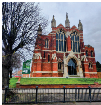
Hope Methodist Church, Higham Ferrers

Counting the Grade 2 listed buildings in the county is more complex because they are listed separately by civil parish or ward and further work would be needed to assemble comprehensive information. Delving into some entries reveals some examples, such as the former Park Road Methodist Church in Rushden, Towcester Roman Catholic Church and Woodford Halse Moravian Chapel all being Grade 2 listed, as well as various chest tombs in some Church of England church yards, such as Desborough and St Mary’s, Rushden.