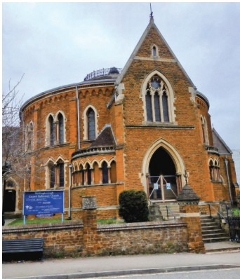
Wellingborough United Reformed Church

A third measure of involvement in NHCT activities is the number of churches of other denominations which are Friends of NHCT. At the time of writing, there are two: Astcote Methodist, Towcester and Wellingborough United Reformed Church.