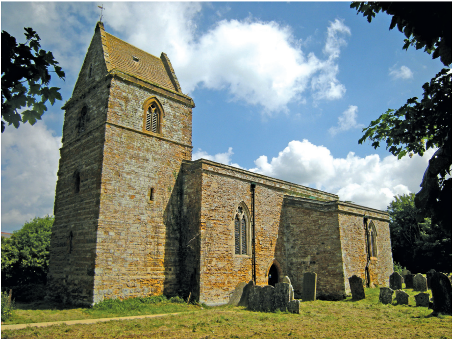
St Luke's, Cold Higham

With thanks to all those who contributed to this Report.