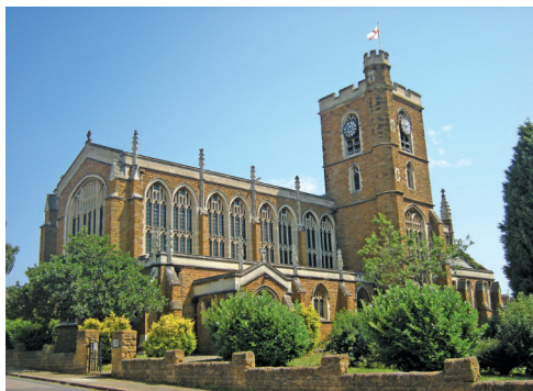
Holy Trinity, Northampton

The Ride and Stride support from the churches and chapels in Northamptonshire is the Trust's main fundraising source. It is largely from the monies raised by the Ride and Stride that we derive our funds to make grants to the County's churches and chapels.