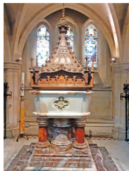
Font in St Matthew’s, Northampton