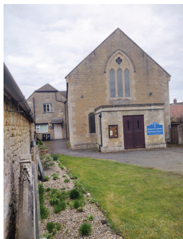
Brigstock United Reformed Church