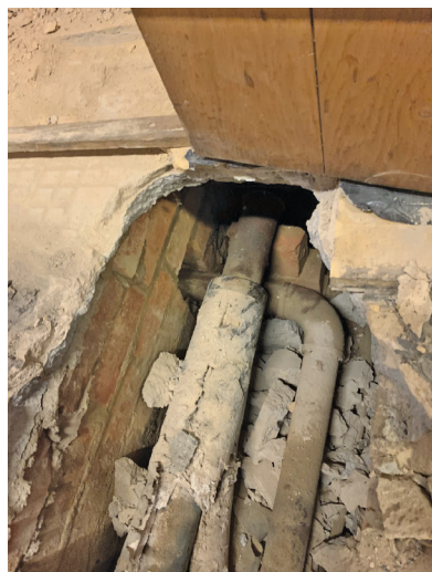
Pipework at Abington – before and after