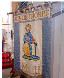
Banner in Kingsthorpe Baptist church, Northampton

Our second stop after walking down Welford Road and into High Street was our home church – Kingsthorpe Baptist – tucked away and quite a simple building. Some of our congregation quite a few years ago, made this beautiful banner with this wonderful text “God so loves the world”. The original church building dates from 1835.