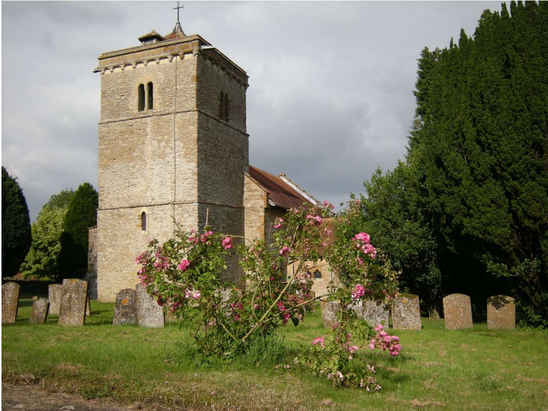
THE MOST HOLY TRINITY, HINTON IN THE HEDGES

ACCOUNTS FOR THE YEAR ENDED 31 DECEMBER 2021