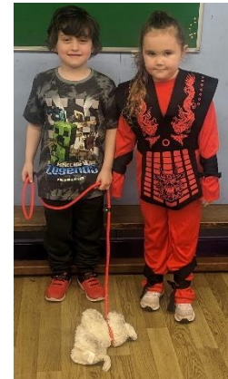
A dog walker and a Ninja