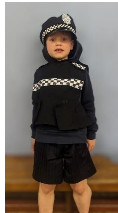
A police man