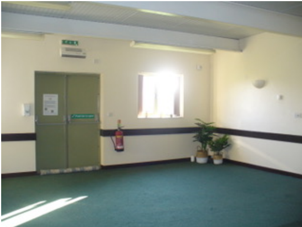
The Marion Faber room

Newport Village Hall is a registered charity and therefore is not liable for income tax or corporation tax on income derived from its charitable activities, as it falls within the various exemptions available to registered charities.