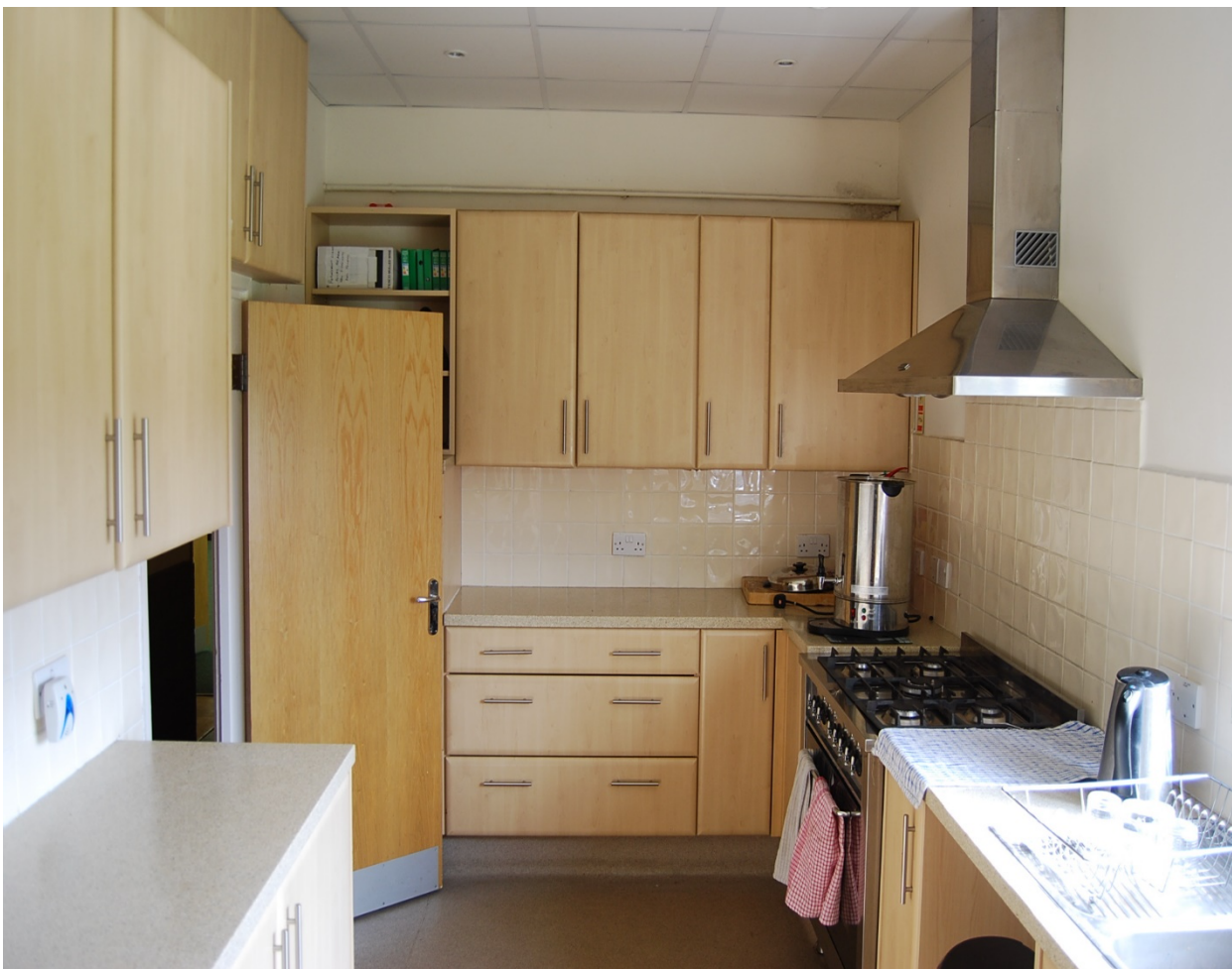
Village Hall Kitchen