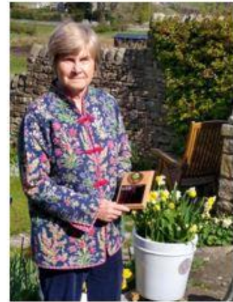
Mickleton Gardening Club Trophy winners, 2020

We were unable to hold our usual September show, so asked members to submit photos of garden produce, along with pictures taken by garden judges, to create a slide show for when we were able to meet again.