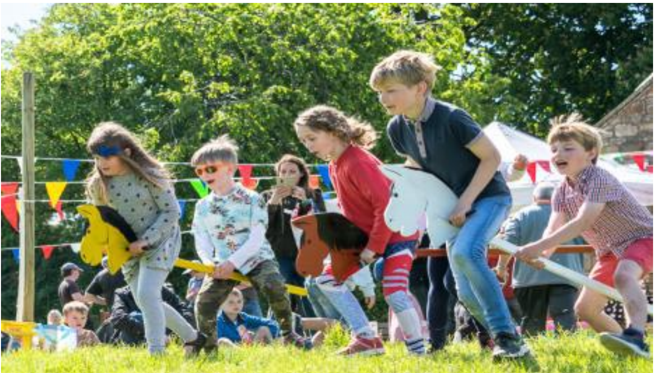
Mickleton Carnival Hobby Horse Racing