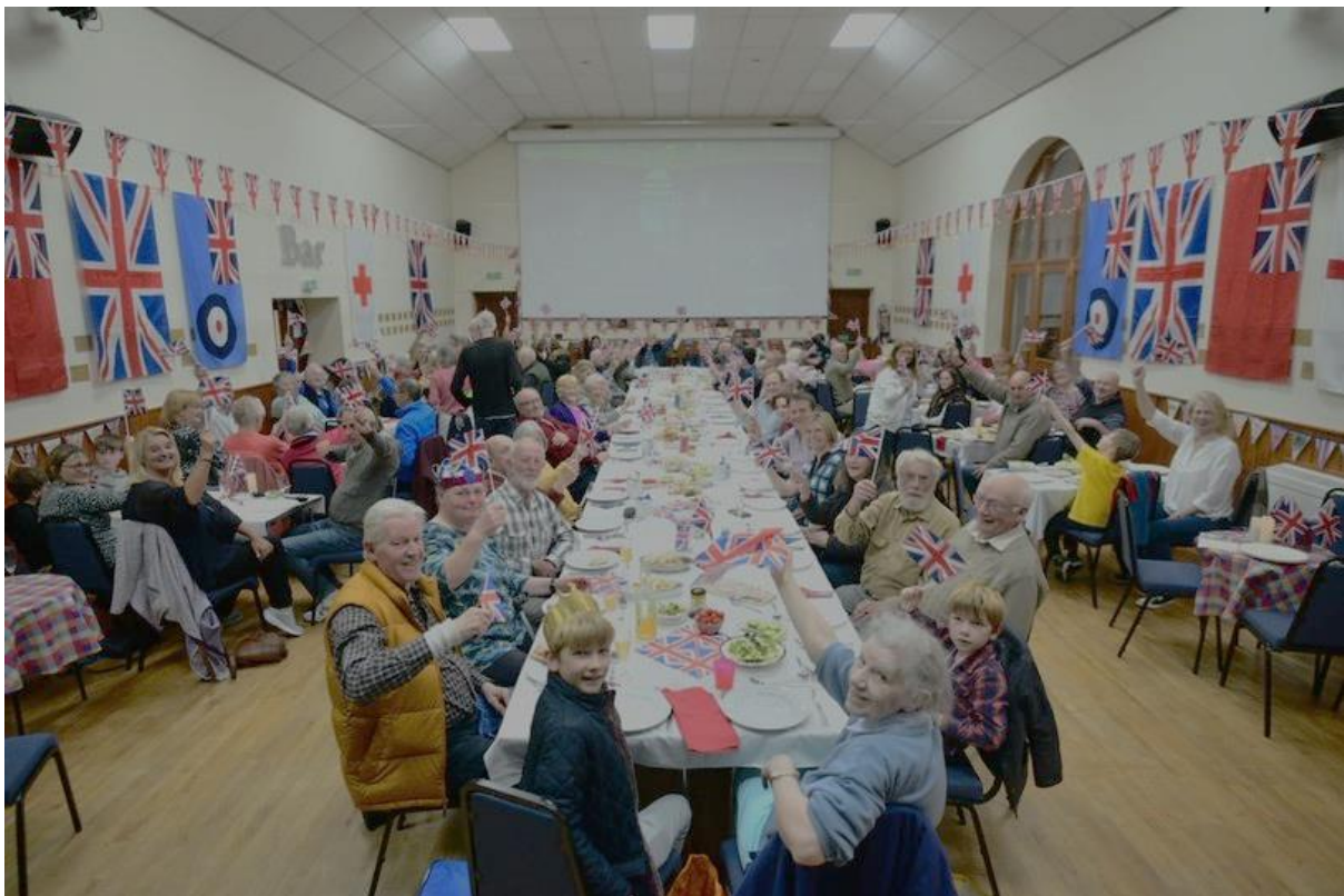
Queen's Platinum Jubilee Celebration (Organised by MiCE)