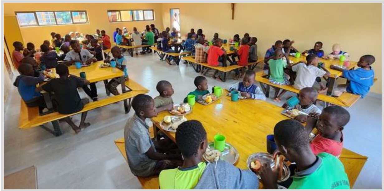
The new dining room at Home of Hope, showing tables and benches made by the boys.

Despite our progress, Zambia continues to face harsh challenges, particularly the ongoing drought, which has impacted nearly every aspect of daily life, including the cost of basic goods. For example, the price of mealie-meal, a staple for us, has risen from ZMW 180.00 in January to ZMW 380.00 per 25kg bag today. We need at least one bag a day to feed the children. Many other essentials, such as tomatoes and sugar, have also seen steep price increases. These hardships have led to a growing number of children being surrendered to Social Services or abandoned, often by single mothers struggling to provide for them.