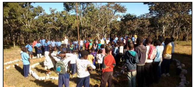
Left: Pre-grade school getting started. Right: Children gathering before school