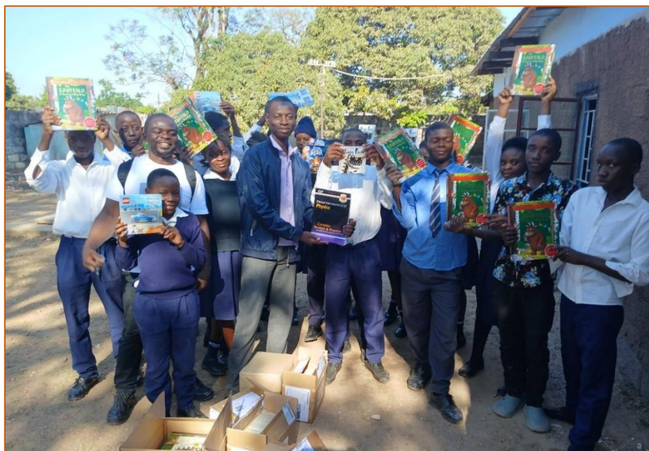
Delivering reading and text books through our partnership with Book Aid International.