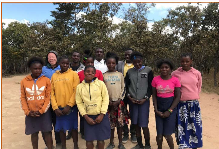
Some of the children on their way to Serenje to sit their entry exams.

A successful school has been established with over 150 students registered up to Grade Six in three classes plus pre-school. A much needed third classroom is currently being built. This year fifteen children sat exams for entry to secondary school in Serenje - fourteen girls and one boy.