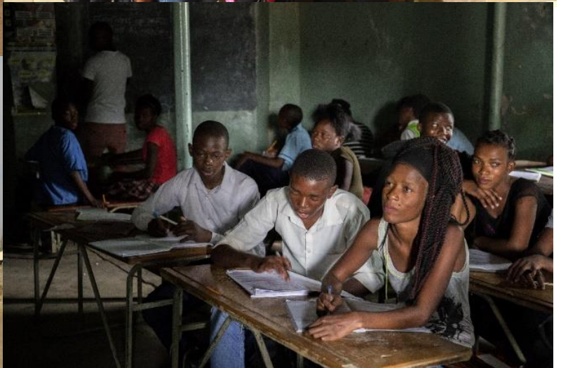
Clockwise from top: Mpunde Mission, Education Grant students, Kwasha Mukwenu, Footballs & Netballs, Home of Hope.