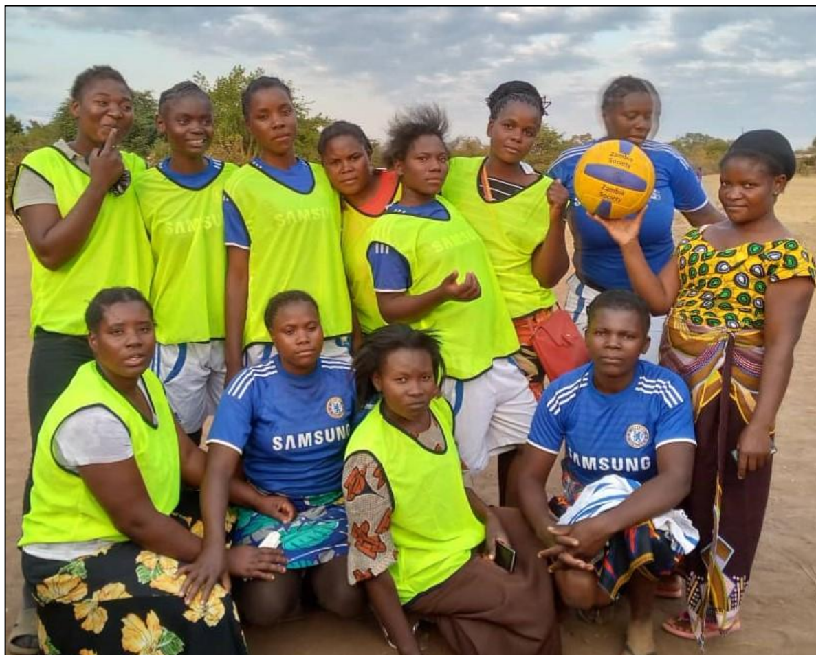
Mawanda Church Netball Team with a netball provided by The Zambia Society Trust