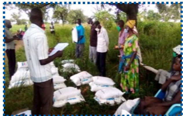
Photographs show a lady in her dried up maize field (top) and beneficiaries on the day of distribution receiving their food. (above and left)