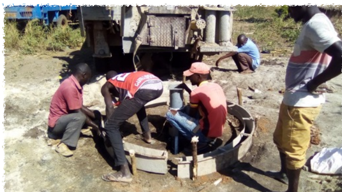
Photos here show the stages of the Amusia borehole construction. Front page photos are of the completed borehole in use and being cleaned by the community.