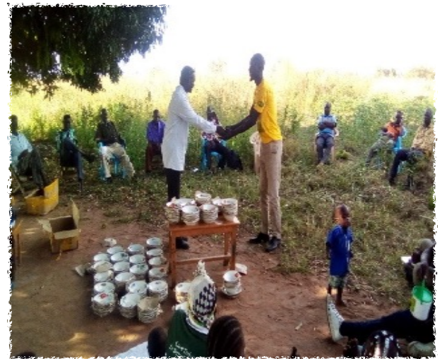
Above right; members of Emonoto Ekeunos VSLA receiving plates as results of their savings and left: Apachito savings group conduct one of their regular savings meetings.