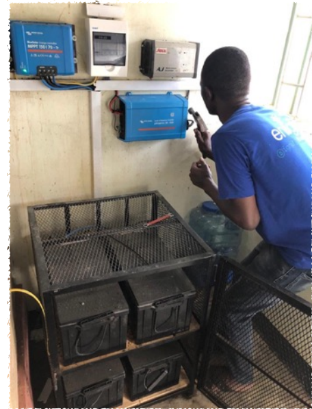
Right: Installation of new inverter at Omiito HC II which converts the DC solar power supply into AC supply for the clinic.

outage costs. A technical survey is being completed by the local supplier - Village Energy, to identify actions and costs. PAG Kumi are managing the work well locally and acting as interface between the local Health Centres and the suppliers.