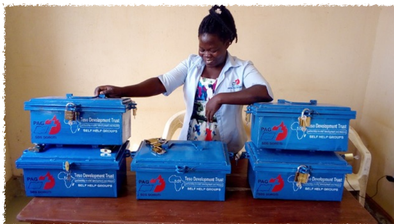
Above: SHG Project boxes to be delivered to the five pilot communities.

The training and set up of the initial 5 groups has proved very successful and going forward PAG Soroti hope to continue to set up more SHGs in the communities that have benefitted from water provision as well as provide ongoing monitoring and support for already established groups.