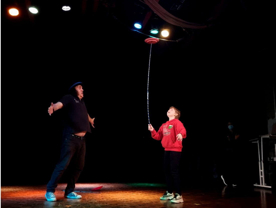
Skylight team member and participant wowing the audience at Skylight's Youth Circus Christmas Show, December 2021